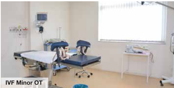
IVF Minor OT