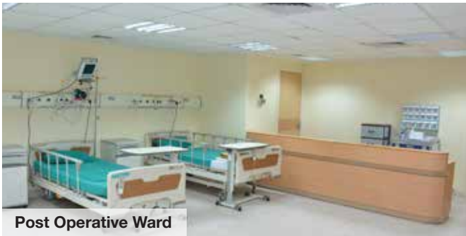
Post Operative Ward