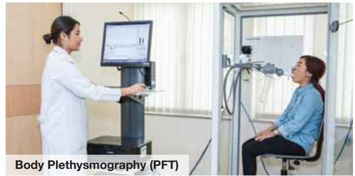
Body Plethysmography (PFT)