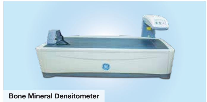
Bone Mineral Densitometer